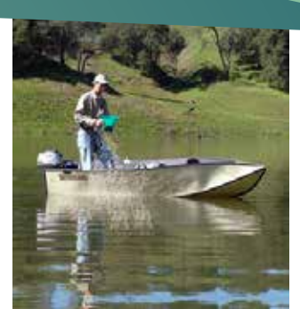
Leaking dam walls