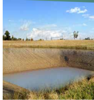
Before using Aquatic Dam Stop Leak Professional