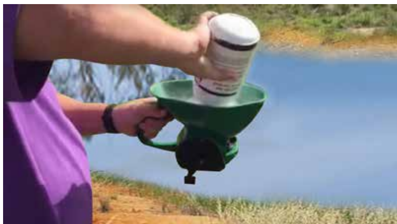
For easy application, use our spreader sold separately.