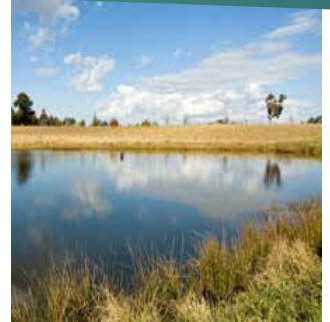
After using Aquatic Dam Stop Leak Professional

Plug your leaking pond or dam quickly and easily with Dam Stop Leak Professional.